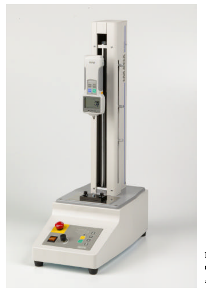
MX-2000N (Force gauges are sold separately.)